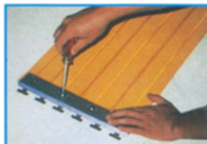
STEP 4: FIX THE SCREWS