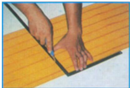
STEP 1: CUTTING PVC STRIP BY YOUR REQUIREMENTS