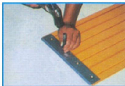
STEP 2: DIG HOLE ON THE PVC STRIP