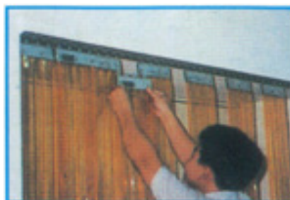
STEP 6: INSTALL PVC STRIP ON THE RAIL